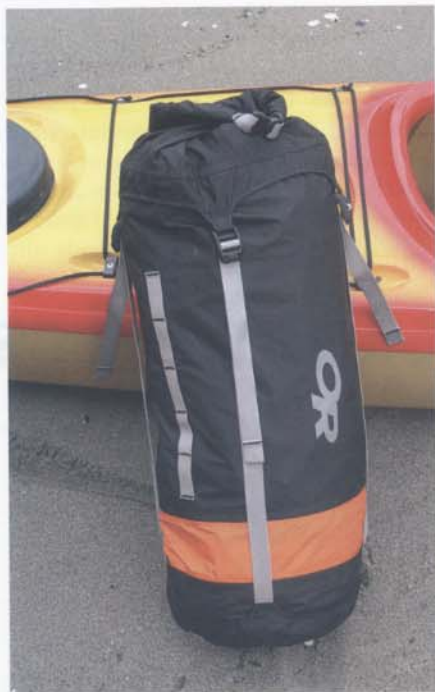
Outdoor Research's Hydroseal DryComp AirX Sack, filled and compressed.

The Outdoor Research Hydroseal DryComp Sacks are available in five sizes: #1 (11.6 liter), #2 (16.7 liter), #3 (23.2 liter), #4 (31.2 liter) and #5 (40.9 liter). There are two color choices: black and cayenne.