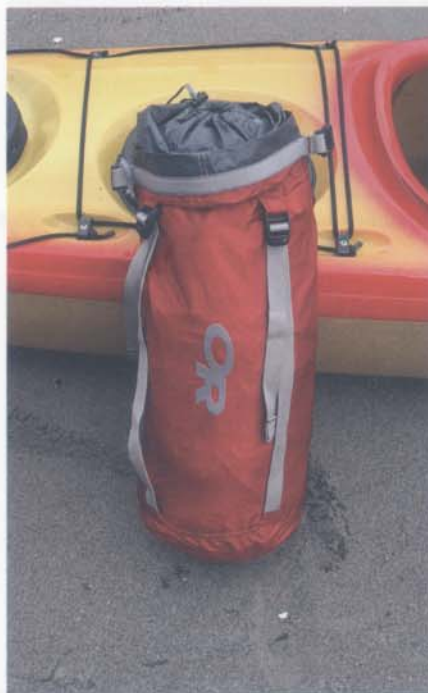
Outdoor Research's Hydroseal DryComp Sack, filled and compressed.