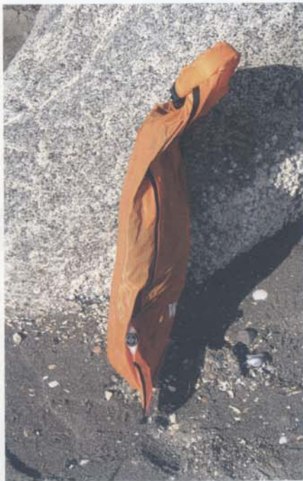
Pacific Outdoor Equipment's WXtEX PNEUMO LTW, filled and compressed.

The purge valve on the PNEUMO LTW (as well as the AquaValve Drybag) can also function as a fill valve if extra flotation is desired rather than compression. Simply open the valve and blow in it just as you would to top off a self-inflating mattress. The extra air will fill the bag to act as a cushion for breakable items or to add backup flotation to your kayak's cargo compartments.