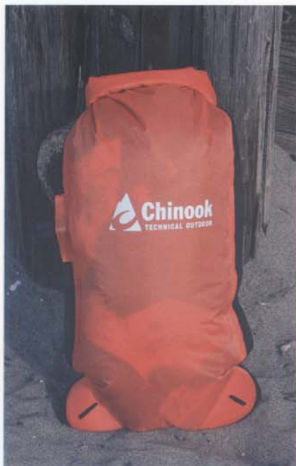
Chinook Technical Outdoors' AquaValve Drybag, filled and compressed.