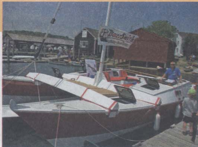
Abaco on display at the Mystic Wooden Boat Show. The 30-foot catamaran drew a steady stream of interested visitors.