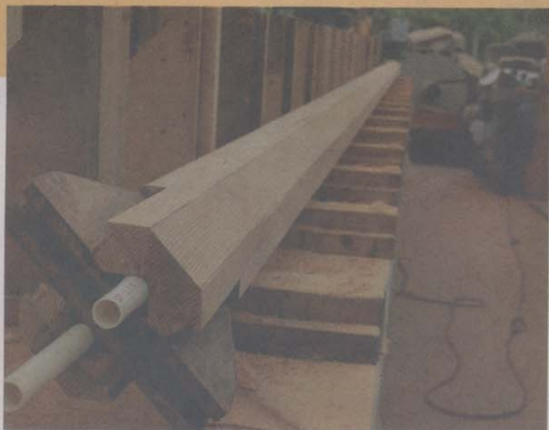
Here is the 32-foot mast after laminating but before final shaping to round. The first step in rounding a square mast is to cut it to 8 equal sides, then 16, then 32.

exceeding the legal width limit. While the Tiki 30 is not the kind of boat you can keep at home and quickly put together for an afternoon sail, it is quite feasible to dismantle it and trailer it to the Chesapeake or the Sea of Cortez. For Southeastern sailors, the ability to get it on a trailer to move inland or north in advance of a hurricane is something to consider.