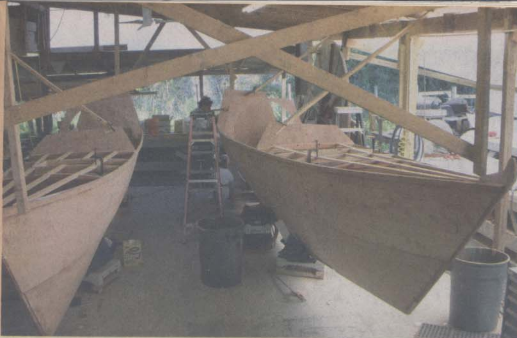
Both hulls were built side-by-side, braced to the shop floor and rafters to keep them aligned until they were rigid enough to be moved. Here you can see the forward deckbeams have been installed.

out any underwater appendages such as dagger boards that could be damaged in a grounding. Designed as a tropical cruiser, the Tiki 30 features a double bunk in each cabin, as well as immense deck and cockpit space, part of which can be converted to accommodations under an optional deck tent. There is a basic, but adequate galley in the port hull and a nav-station to starboard. Wharram designs boats that sail well, and above all are safe and seaworthy. He refuses to compromise these characteristics for comfort, so you won't